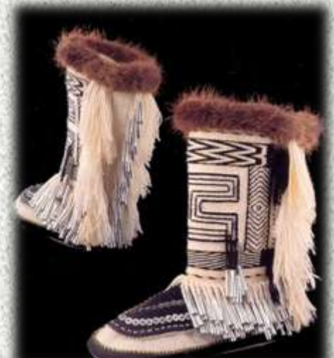
Ravenstail High Top Moccasins, exhibited at the Spirit Wrestler Gallery, Vancouver