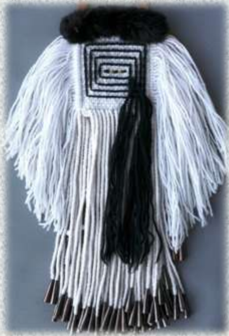
Traditional Ravenstail Medicine Bag

We will spend these three creative days exploring the twining techniques used by native weavers of the Pacific Northwest Coast to create their magnificent Chief's cloaks. Ravenstail is one of the oldest weaving styles used on the coast and is a direct adaptation of basketry techniques. Ravenstail was practiced on the coast until the end of the 1700's, when it was replaced by the innovative Chilkat style. The revival of Ravenstail began in 1987 and weavers up and down the coast are now practicing this ancient art form and new robes, aprons, and leggings are being used again in ceremony. We will feel the spirit of genius inherent in the early weavers by making a small medicine bag using the traditional techniques, patterns and colors.